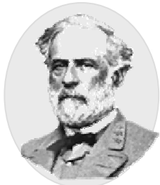
Robert E. Lee