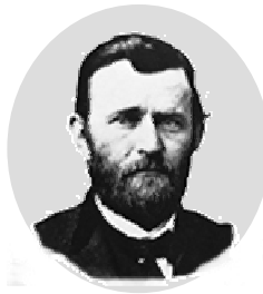
Ulysses S. Grant